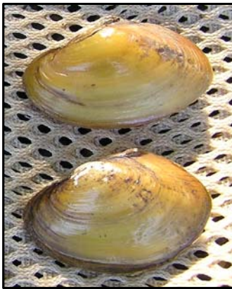
Figure 6. Yellow lampmussel ( Lampsilis cariosa ), photo by Beth Meyer.

Based on our sample, the mollusks represent one taxonomic group in Pennsylvania that is likely to be negatively affected by climate change. All of the mussels below share similar risk factors that contribute to their heightened vulnerability. These risk factors include: inability to disperse well beyond their current range due to anthropogenic barriers (i.e., dams), water quality issues associated with climate change mitigation activities, poor dispersal mechanisms, negative affects of increased flooding due to change in precipitation patterns, and the fact that all of the mussels depend on a few fish species to serve as glochidial hosts.