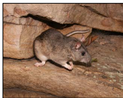
Figure 5. Allegheny woodrat ( Neotoma magister ), photo by Charlie Eichelberger.

The climate change vulnerabilities of four mammals from Pennsylvania's WAP were assessed. Both the eastern small-footed bat ( Myotis leibii ) and the Allegheny woodrat ( Neotoma magister ) are habitat specialists, a risk factor that contributes to their moderate vulnerability score. In addition, the eastern small-footed bat may be negatively impacted by wind farm development and use, requires cooler microenvironments within caves, and has experienced less than average precipitation variation within its Pennsylvania range. The Allegheny woodrat typically does not disperse long distances and is restricted in its movement beyond its current range due to natural and anthropogenic barriers.