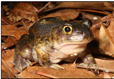
Figure 2. Spadefoot toad ( Scaphiopus holbrookii ), photo by Charlie Eichelberger.

Four amphibians from Pennsylvania’s WAP were evaluated and have risk factors in common that contribute to their extremely or highly vulnerable index scores. The main CCVI risk factors contributing to vulnerability include: the presence of natural and anthropogenic barriers that limit a species’ ability to move beyond its current range in Pennsylvania, inability to move long distances to colonize new sites, and dependence on cooler microsites and moisture regimes that will likely be altered by climate change. Eastern hellbenders ( Cryptobranchus alleganiensis ) and Jefferson salamanders ( Ambystoma jeffersonianum ) also require specific physical habitat features (i.e., stream bottoms with boulders and large, flat rocks and vernal pools with pHs within a specific range) and have restricted diets that add to their likely vulnerability to climate change.