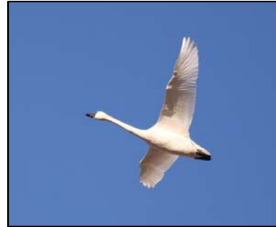
Figure 3. Tundra swan ( Cygnus columbianus ), photo by Charlie Eichelberger.

The vulnerabilities of nine WAP birds were considered. Overall, the CCVI results suggest that these birds are less vulnerable to short-term climate change effects and many may actually increase their abundance/range in Pennsylvania. These results are not surprising given that the birds examined are able to disperse over long distances, move over or around natural and anthropogenic obstacles, and tend to have less habitat specificity in terms of geologic features, temperature and hydrologic regime.