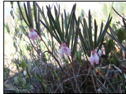
Figure 7. Bog-rosemary ( Andromeda polifolia ), photo by Denise Watts.

Forty plants were included in this climate change vulnerability assessment and range from extremely vulnerable to presumed stable. Vulnerability to climate change is due to a combination of multiple risk factors. The most common risk factors were: natural barriers exist that could inhibit northward migration, limited dispersal capabilities, restricted to cooler environments found at higher elevations and along the northern tier of Pennsylvania, dependence on a specific hydrological or moisture regime (i.e., wetland obligate plants), and dependence on other species (i.e., requires mycorrhizal associations). The white-fringed orchid ( Platanthera blephariglottis ) and willow oak, ( Quercus phellos ) are also restricted to uncommon geologic features such as mesic calcareous forests and wet, sandy coastal soils. The vulnerability of the white trout-lily ( Erythronium albidum ) is increased by its dependence on ants to aid in seed dispersal.