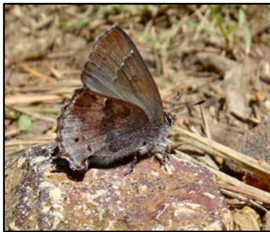
Figure 4. Frosted elfin ( Callophrys irus ), photo by Monica Miller.

Several butterflies, moths, dragonflies, and beetles were evaluated. The species that appear more vulnerable to climate change generally have several risk factors in common that contribute most to their vulnerability. For the butterflies and moths, those risk factors include: an association with cooler environments, dependence on only a few host plants, and sensitivity to changes in soil moisture and/or hydrological regime. On the other hand, the ability to disperse longer distances to new sites, lack of habitat specialization, and positive responses to disturbance were factors that contributed a higher