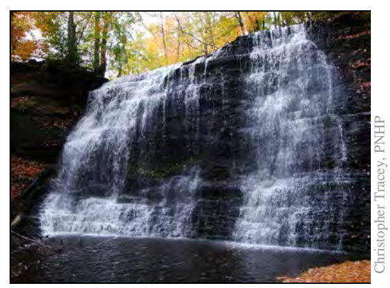
Howard Falls, the largest waterfall in Erie County, marks the beginning of the gorge that runs through Falls Run.