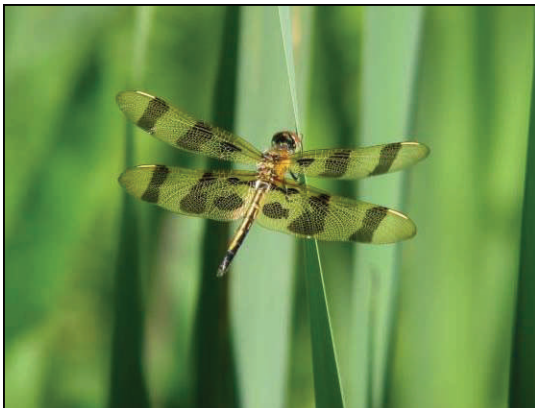
A female Halloween pennant on cattails in the marsh where Muddy Creek flows into Lake Arthur

Most of the NHAs are centered on waterways, floodplains, wetlands, and the steep slopes above waterways. Clusters of NHAs are present along