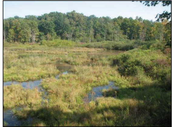
Beaver ponds along Blacks Creek