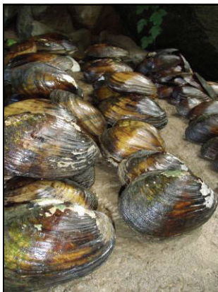
Fatmuckets ( Lampsilis siliquoidea ) and spikes ( Elliptio dilatata ) from Conneaut Creek surveys

In 2011, Heritage staff participated in a Great Lakes mussel project that conducted more than 100 surveys of Lake Erie bays, wetlands, and tributaries, including Presque Isle Bay and Conneaut Creek in Pennsylvania. The researchers discovered more than 2000 live mussels from 22 species inhabiting Great Lakes coastal wetlands. Planning has begun for additional surveys in Presque Isle Bay in 2012.