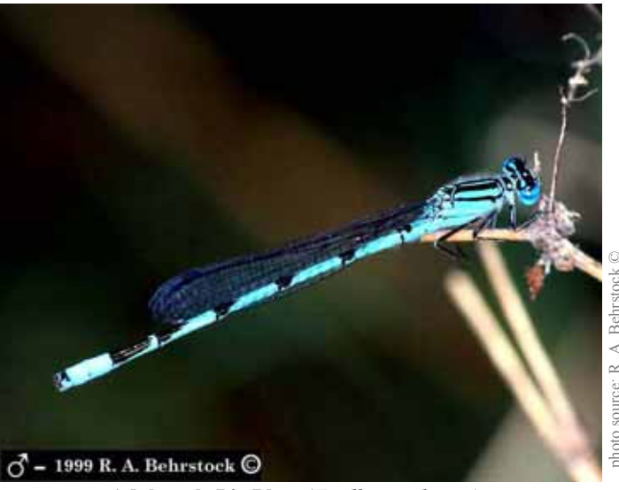
Adult male Big Bluet (Enallagma durum)

Preservation of this species in the Commonwealth will require the protection and restoration of the few areas of remaining tidal marsh along the Delaware River. Additionally, shade-providing vegetation along marsh and river edges appears to be important to maintaining populations of this species and will need to be restored in areas where it has been removed.