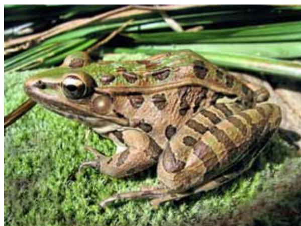
Southern Leopard Frog ( Lithobates sphenoccephala ) with prominent white spot on the tympanum.

The Southern Leopard Frog is typically 50-80mm (2" to 3¼") long, and has a narrow snout. The color of the Southern Leopard Frog is quite variable, with some individuals being green, some dark brown, and every shade in between. The belly of the frog is white. A conspicuous white spot can be found in the center of the tympanum, or ear spot. Breeding calls of this species has been likened to the sound of muffled laughter, and this species is known to only call after dark. The Southern Leopard Frog may be confused with the Northern Leopard Frog ( Lithobates pipiens ) or the Pickerel Frog ( Lithobates palustris ). The Northern Leopard Frog has been found nearly statewide, but does not tolerate the brackish waters often inhabited by its southern cousin. Lacking the Southern Leopard Frog's tympanic white spot, the Northern Leopard Frog has suffered declines and is also considered a species of concern in the Commonwealth. The Pickerel Frog is a very common species, and while spotted like the Leopard Frogs, the Pickerel Frog has squarish spots and a yellow tinge between the hind legs and on the lower portion of the belly. The Pickerel Frog can be found statewide, and is typically associated with vegetated flowing streams and creeks.