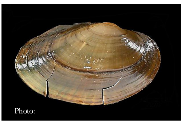
http://webdev.museum.state.il.us/ismdepts/zoolog y/mussels/gallery.html?RollID=mussel_01&Fram eID=anodontoides_ferussacianus6

The cylindrical papershell (Anodontoides ferussacianus) is a small mussel, usually less than 75 mm in length. The shell is subelliptical, elongate, thin, and moderately inflated (Parmalee 1998; Sietman 2003; Strayer and Jirka 1997). The anterior margin is rounded whereas the posterior margin is bluntly pointed. The posterior ridge is rounded but distinct. The dorsal margin is straight and the ventral margin has a slight indentation, appearing "pinched" at the midpoint. The beaks are somewhat inflated and slightly raised above the hinge line (Parmalee 1998). The beak sculpture is fine and consists of two or three concentric ridges at the peak of the umbo (beak). Hinge teeth are absent but pseudocardinal teeth appear as irregular swellings along the hinge line. The periostracum (outer covering) is usually light green to yellowish brown, sometimes displaying green rays (may appear faint in adult Black concentric bands on the surface are specimens). indicative of rest periods during growth. The nacre (inner