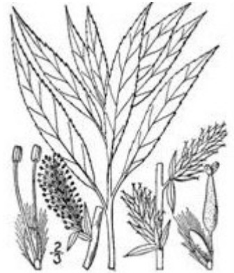
USDA-NRCS PLANTS Database - from Illustrated flora of the northern states and Canada . (Britton, N.L., and A. Brown, 1913. Vol. 3: 109.)

Flowers are small and without petals, borne in dense, fluffy-looking spikes called catkins, which grow 1 to 3.5 centimeters long.