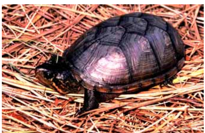
Eastern Mud Turtle (Kinosternon subrubrum subrubrum)